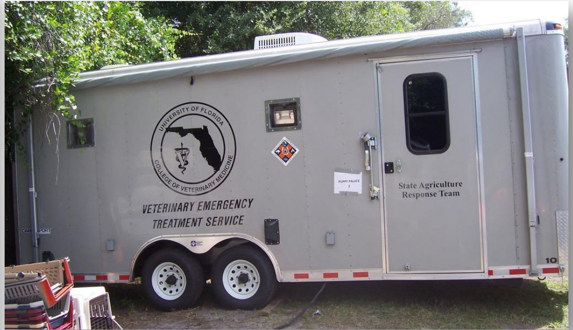
Puppy Palace 2